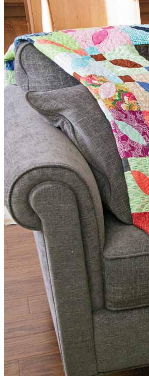
This inspiring antique quilt top is a virtual encyclopedia of fabrics of its era.